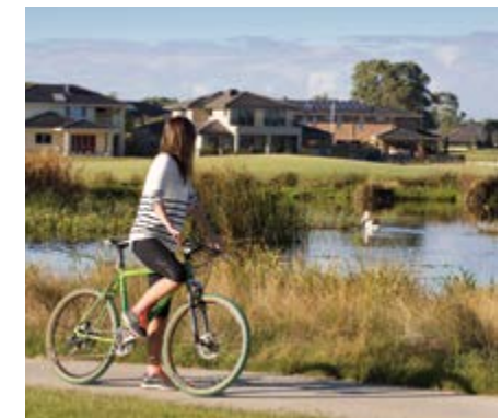
Sandhurst Golf Estate - Sandhurst