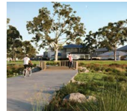
FindonView - Wollert

Alto will be created in a way that captures the spirit of community living.